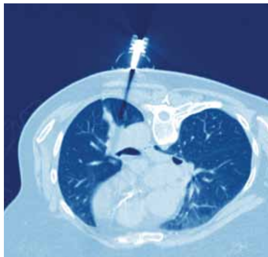
SeeStar® aids the physician by producing an artifact in the CT image, indicating the intended needle path.

AprioMed provides tools that enable physicians to optimize precision and control during the most challenging procedures. For more information about AprioMed's Interventional Radiology products please visit www.apriomed.com .